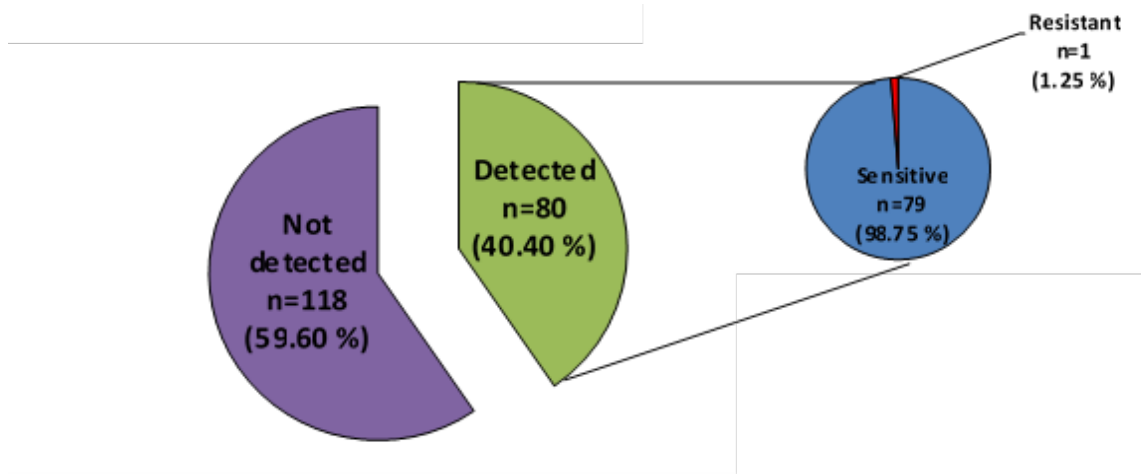
Fig. 2: Prevalence of TB infection and rifampicin-resistant isolates