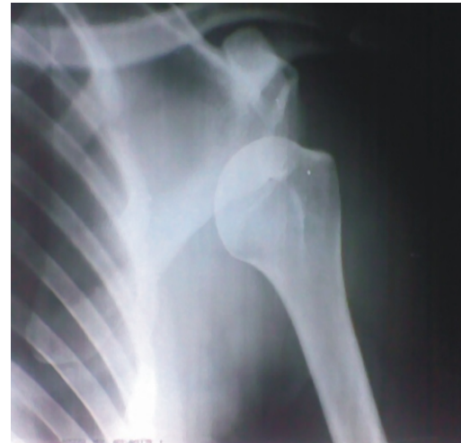
Figure 2b Plain Radiograph of the left shoulder showing anterior dislocation