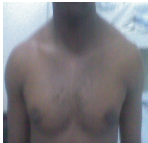
Figure 3 Clinical Photograph of the Patient after close reduction of the dislocation