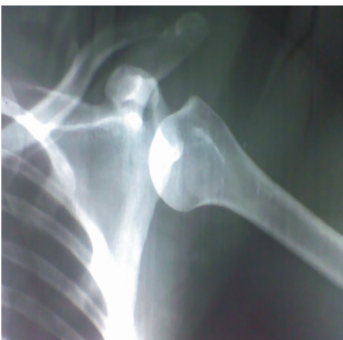
Figure 2a Plain Radiograph of the left shoulder showing anterior dislocation