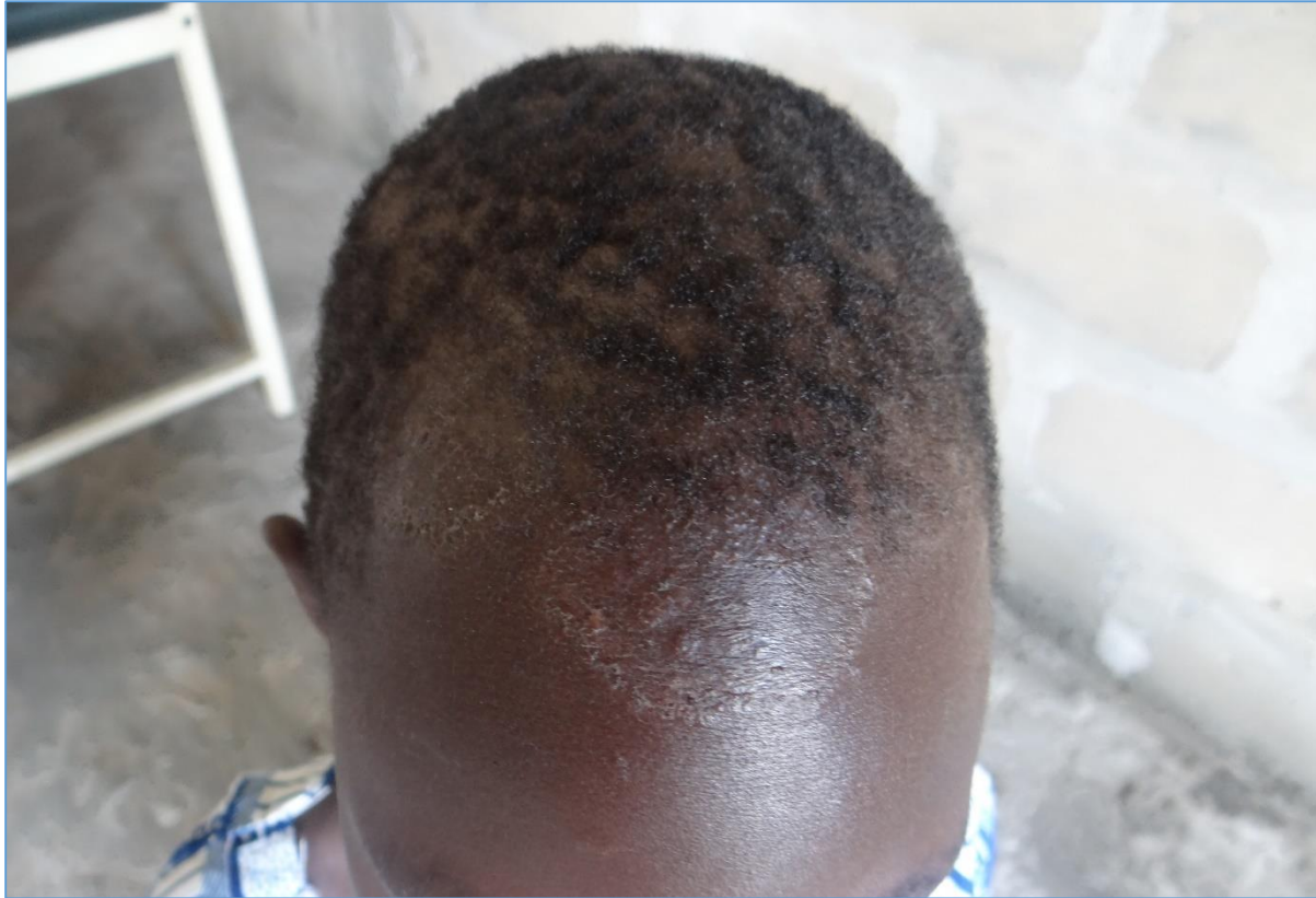
Figure 3. Tinea capitis