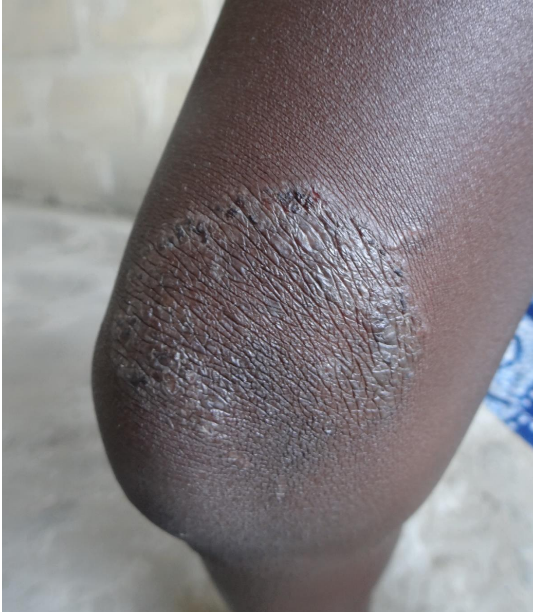
Figure 4. Tinea corporis