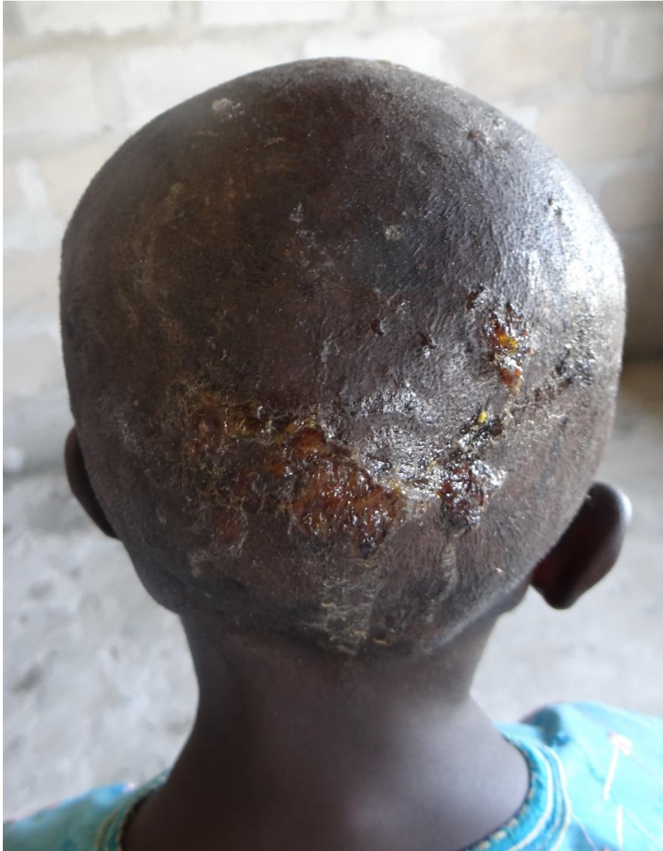
Figure 2. Tinea capitis complicated by kerion