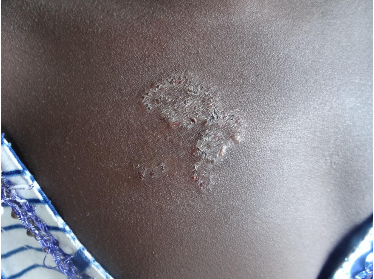
Figure 5. Tinea corporis