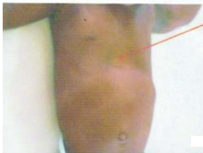
Figure 1: Showing Pectus Excavatum deformity

The patient has completed 9 months of intensive and continuation phase of anti-tuberculosis therapy with rifampicin and isoniazid. The repeat and interval repeat chest x-rays done at three months showed significant interval change indicating resolution of the tuberculous pneumonia (Figure 4). The child weight and other anthropometric and haematological parameters also indicate a resolution. No significant change has been observed in the pectusexcavatum. The patient did not experience any significant drug adverse effects in the course of treatment. He is still undergoing regular follow up at the paediatric and orthopaedic clinic.