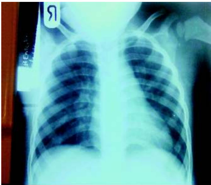
Figure 4: Chest X-Ray Taken After 3 months Of Treatment