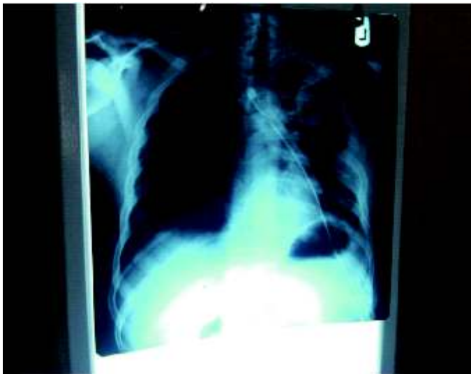
Fig.3a; Chest radiograph PA View immediate postoperatively