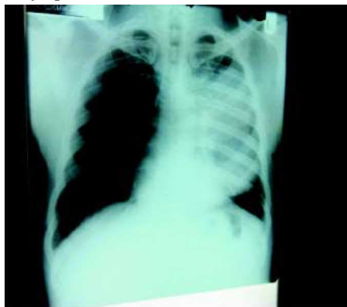
Fig. 1a: Chest Radiograph PA View before surgery showing the mass in the left hemithorax and left lung atelectasis

At surgery, through a 5th left posterolateral thoracotomy, a well encapsulated mass in the left hemithorax; surrounded by and attached to the left lung; to the posteromedial part of the pericardium and to the posterior chest wall, was dissected out en block. Due to difficulty in the dissection of the tumor; proximity to the heart and attachment to the pericardium the mass was decompressed by opening into it and carefully removing the contents. This decision was taken due to anesthetist's observations in which preceding attempts at mobilization resulted in rapidly progressive oxygen desaturation and low blood pressure state. The excised tumor (Fig. 2) was brownish, well circumscribed, had a thick capsule, lobulated, multicystic, filled with mucinous / sebaceous materials, hair, bone-like tissue and teeth. It measured 20 X 12 X 10cm 3 . Postoperative chest radiograph showed total resolution of the preoperative left lung atelectasis (Fig. 3a & 3b). Patient made an uneventful recovery and was discharged on the 12th post-operative day. Histopathological examination confirmed benign mature mediastinal teratoma. He has been followed up for 2 years without any signs or symptoms of recurrence.